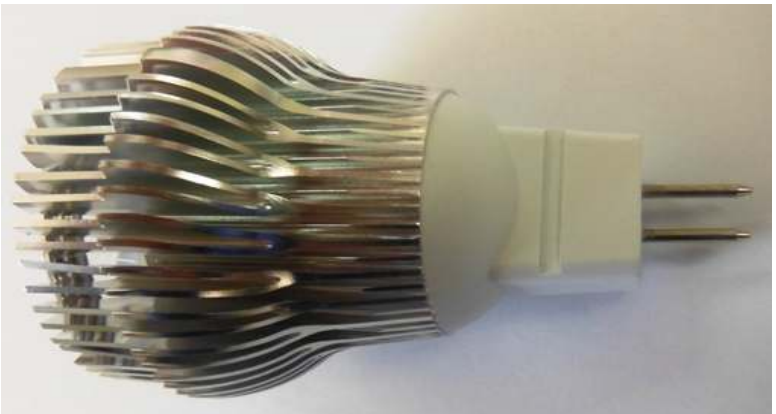
©2012 U-Tron (Beijing) Electronics Co., LTD All rights reserved Specifications are subject to change without notice